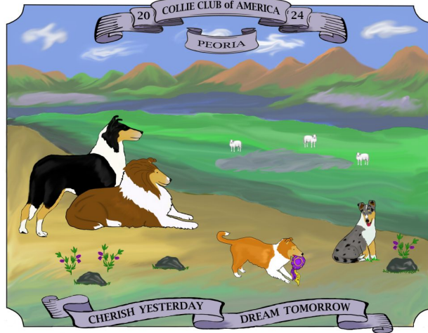
(Licensed by the American Kennel Club)

Sunday and Monday, March 31 and April 1, 2024: All Standard, JWW, FAST & T2B Classes (No Premier) FEO available for FAST & T2B.